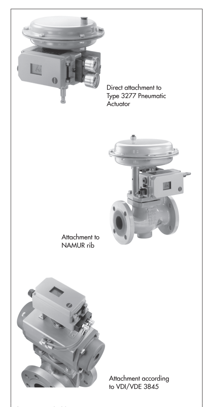
Fig. 1: Type 3730 Positioner